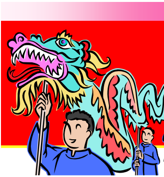
Running the Dragon

This Fun Days we are hoping to get many helpers to run the Dragon down the Highway in the Parade. We will need seven folk and 5 more to make bubbles, get your friends together. It is fun to be part of the entertainment for the 14th July.