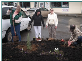
Herb Talk .. folk planted ed-