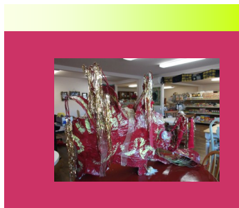
Building the Dragon head.

She then rests as her entourage join together in fun to celebrate an Asian feast in honor of the New Year Spirit. You can see the original painting of the first parade on the wall at the Visitors Center.